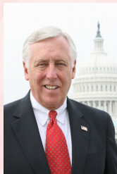
Majority Leader Steny Hoyer (D-MD)