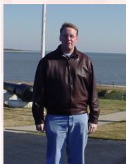
Who is this guy?