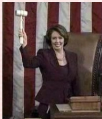
Speaker of the House Nancy Pelosi (D-CA)