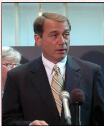
John Boehner, Republican Leader (R-OH)