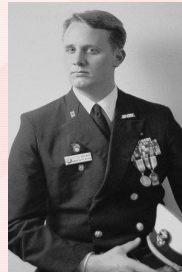
Does this count for experience?