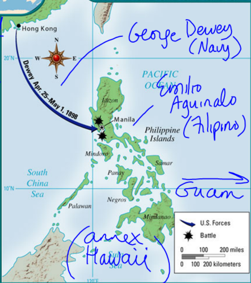
The Spanish-American War, 1898.