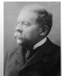
Richard Olney