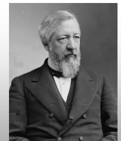
James G. Blaine